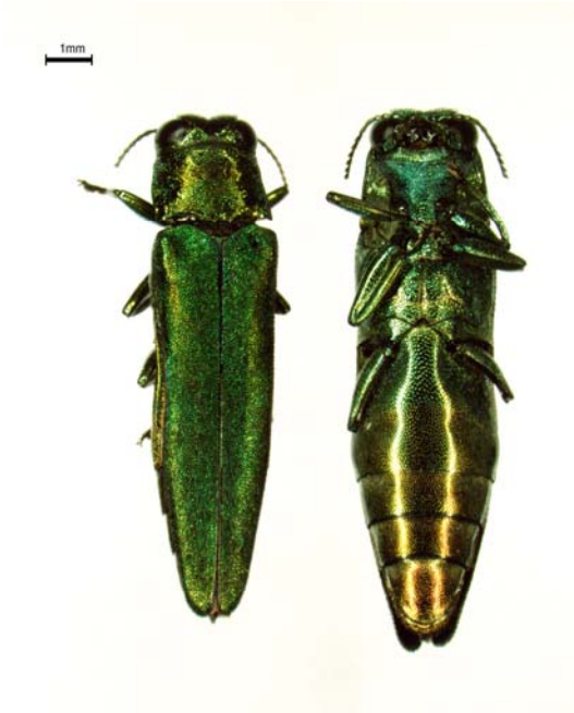
Figure 1. Agrilus planipennis Fairmaire.

Members of the genus Agrilus are challenging to identify due to structural coloration and subtle morphological differences between species. Furthermore, the presence of newly discovered exotic Agrilus species in the Midwest and Ontario complicates identification issues and demands a renewed interest in applied taxonomy of Agrilus beetles.