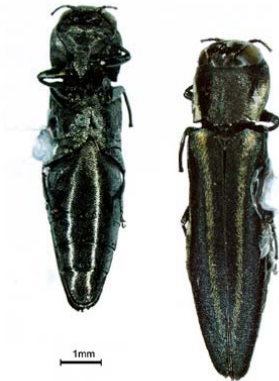
Figure 4. Agrilus bilineatus (Weber)