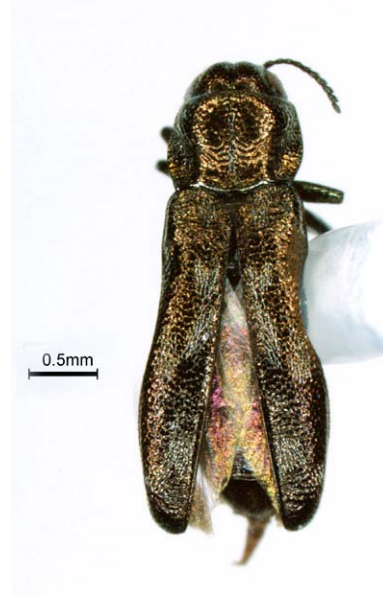
Figure 10. Agrilus subcinctus Gory

small in size (>4.0 mm) and features a distinct subbasal and subapical spots of scale-like pubescence on the elytra (Figure 10).