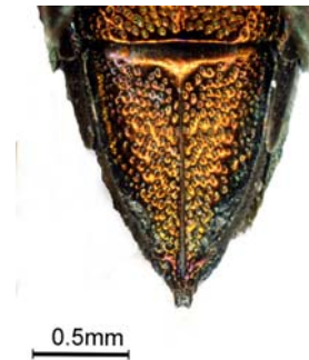
Figure 2. Pygidium of A. planipennis .