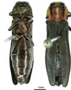
Figure 7. Agrilus vittaticollis (Randall)