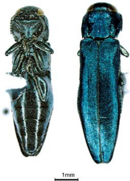
Figure 5 Agrilus cyanescens Ratzeburg