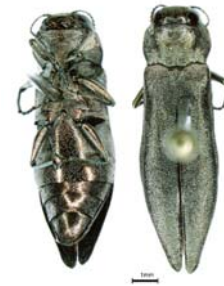
Figure 6. Agrilus anxius (Weber)